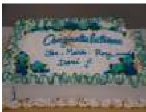
It wouldn't be a COA Annual Meeting without the Award Winners cake.