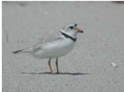
Piping plover

This sand peninsula was also affected by the recent storm. Last year was a poor year here for nesting Least Terns (0) as well as Common Terns and Black Skimmers (0) which had nested here in the past. The reason for the lack of nesting birds is unclear but may have been due to flooding or predation.