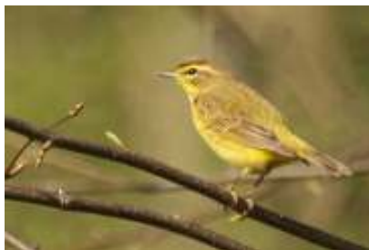
Palm warbler