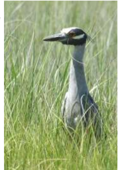
Yellow-crowned night heron