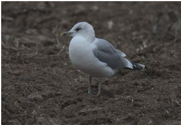
Mew Gull, 4 January 2015, Southbury