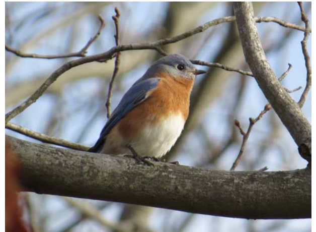
Eastern Bluebird, 14 December 2014, Quinnipiac Valley Christmas Bird Count