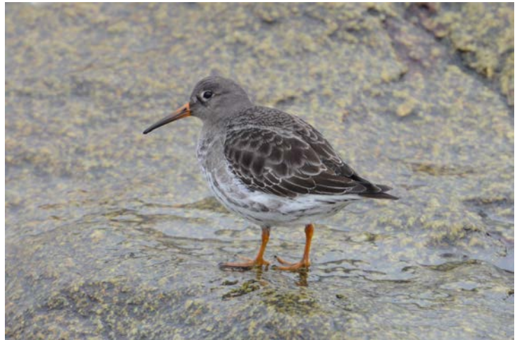
Purple Sandpiper, 20 December 2014, East Haven/ New Haven Christmas Bird Count