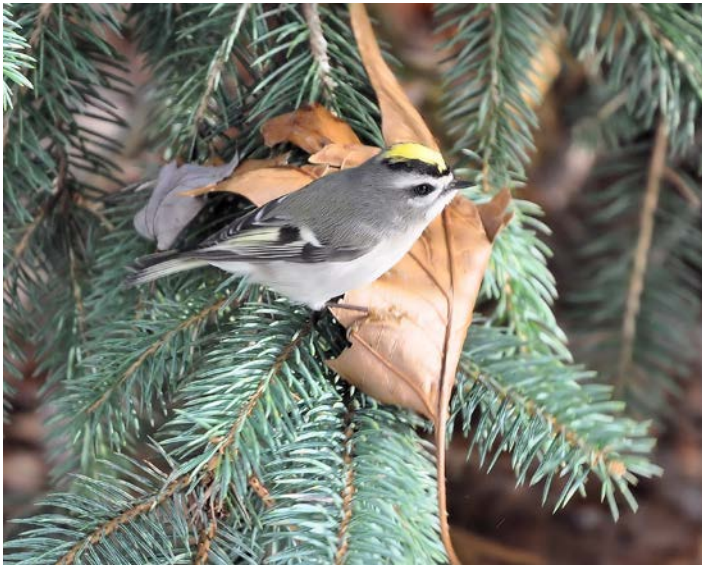
Golden-crowned Kinglet, 25 November 2014, East Haddam