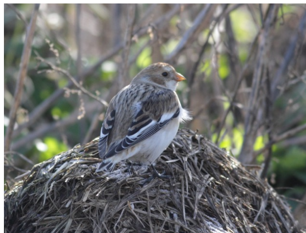
Snow Bunting, 14 December 2014, Moodus/Salmon River Christmas Bird Count