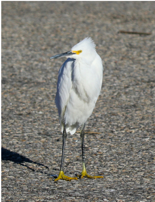
Snowy Egret, 7 December 2014, Stratford/ seen also on Stratford-Milford CBC 21 Dec.