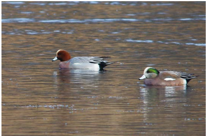
Eurasian Wigeon with American Wigeon, 30 December 2014, Milford