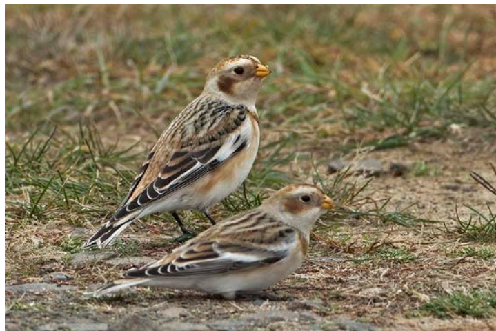
Snow Buntings, 16 November 2014, Madison