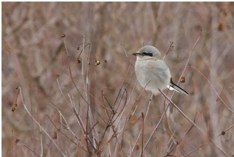
Northern Shrike, 15 January 2015, Haddam Meadows State Park, Haddam