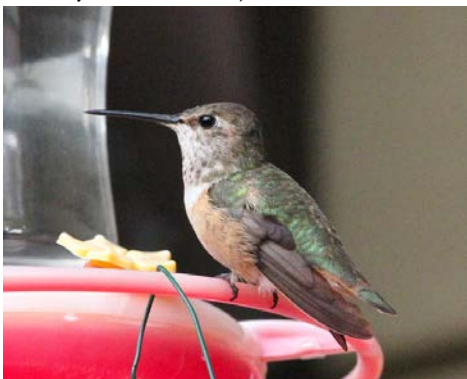
Rufous Hummingbird (female), 22 December 2014, Trumbull/seen also 21 Dec. on the Stratford-Milford Christmas Bird Count