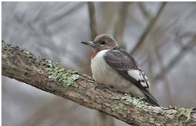
Red-headed Woodpecker, 16 November 2014, Colchester