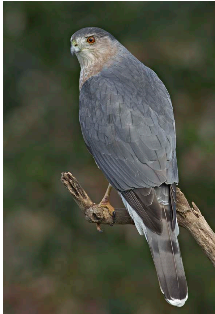
Cooper's Hawk, 14 November 2014, Mansfield