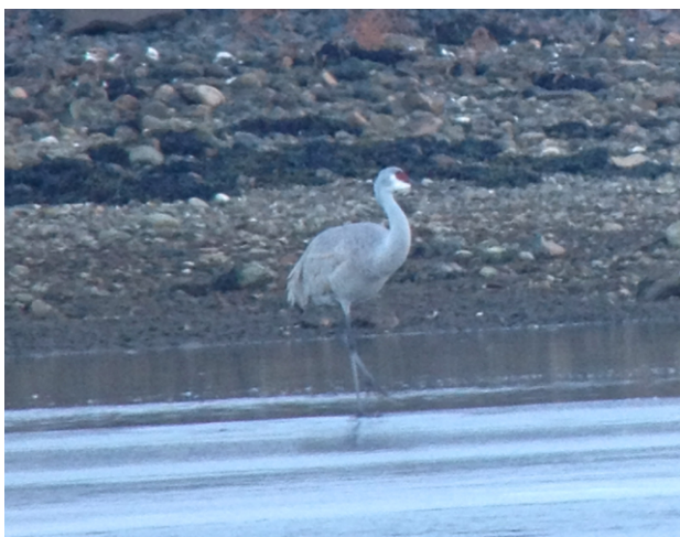
Sandhill Crane, 20 January 2015, Stonington