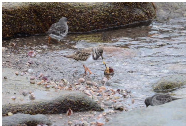
Ruddy Turnstone with Purple Sandpiper, 20 December 2014, East Haven/New Haven Christmas Bird Count