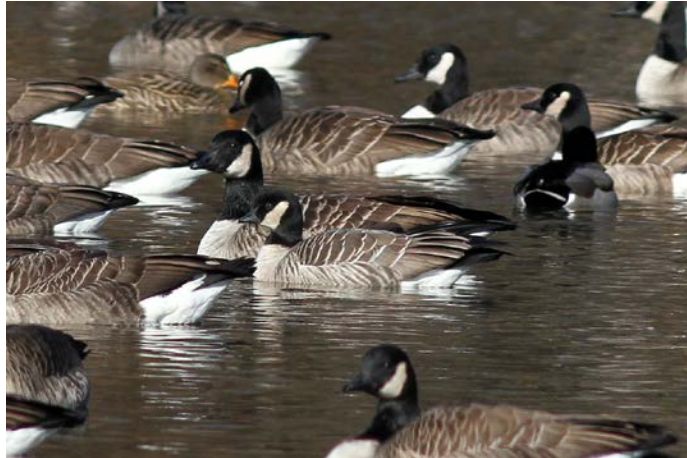
Cackling Goose with Canada Geese, 1 January 2015, Goodwin Park, Hartford