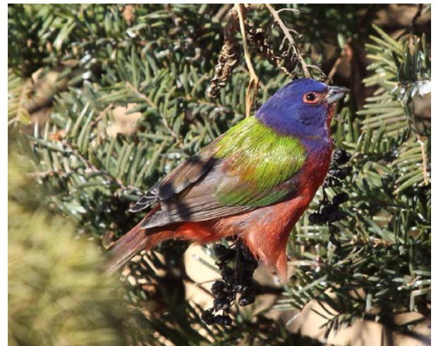
Painted Bunting (adult male), 10 January 2015, Cove Island Sanctuary, Stamford