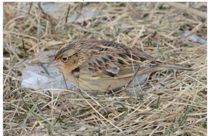
Left & Above - Grasshopper Sparrow, 10 January 2015, Hammonasset Beach State Park, Madison