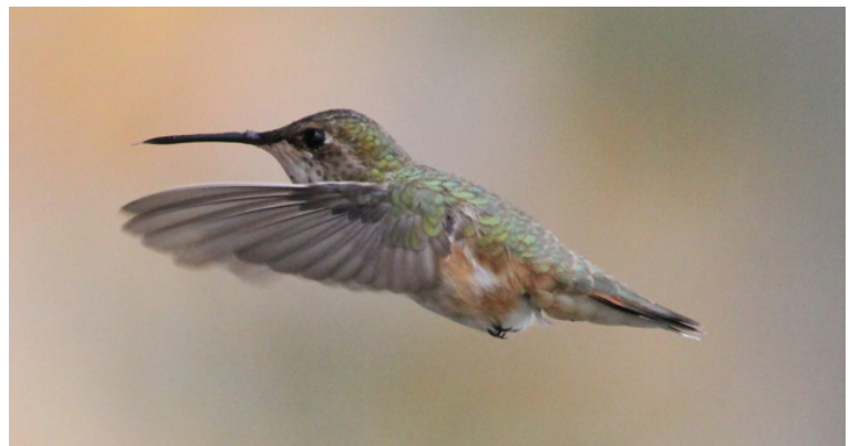
Rufous Hummingbird (immature female), 16 November 2014, Stratford/seen also during Count Week on the Stratford-Milford Christmas Bird Count