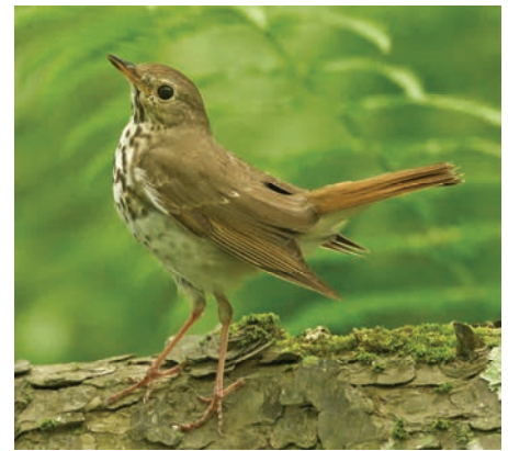
Hermit Thrush

Contact Chris Loscalzo at loscalz@optonline.net and 203 389-6508.