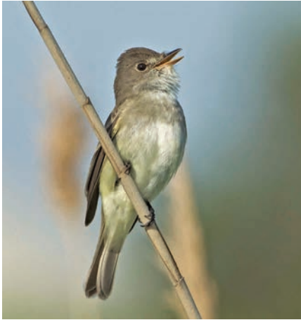
Willow Flycatcher