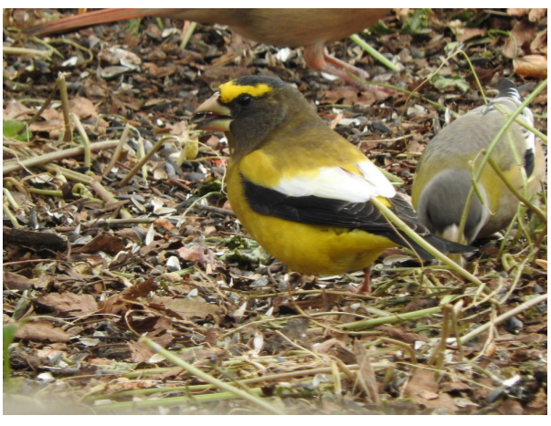
Evening Grosbeak, Andover