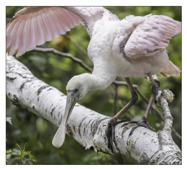
Roseate Spoonbill at Ravens Pond, Stratford (Lesley Roy, 10/23/18)