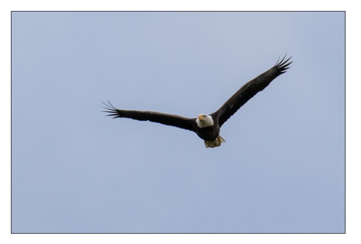
Bald Eagle (Chris Wood)