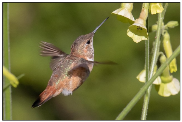
Rufous Hummingbird at Westport (Chris Wood, 10/28/18)