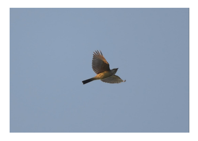
Western Kingbird at Bluff Point (Dave Provencher, 9/29/18) - observed during morning flight