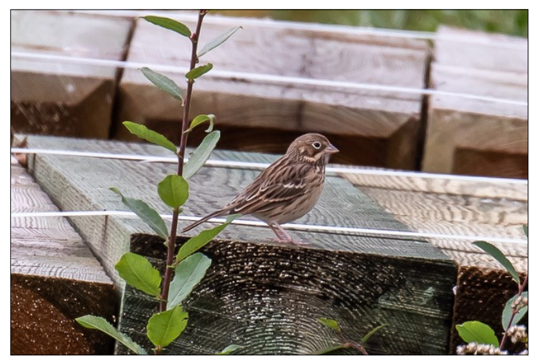
A textbook Vesper Sparrow (Chris Wood)