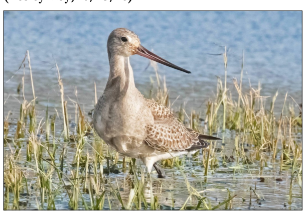
Hudsonian Godwit at Hammonasset Beach State Park (Bill Batsford, 10/20/18)