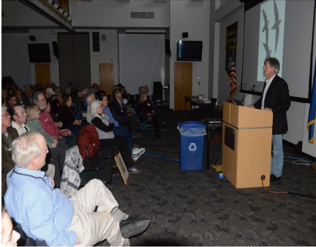
David Sibley takes us on the journey from precocious child artist to the “Sibley Guide for Birds”