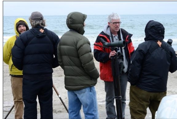
Gull workshop participants in the field putting their classroom learning to the test