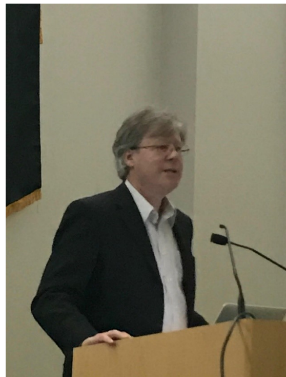
David Sibley chose the career of field guide author at an unusually young age, becoming the highly regarded author and artist he is today