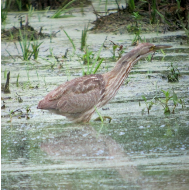
American Bittern at Wimisink Marsh in 2014. Mini-Grant to Naromi Land Trust for habitat improvement.

UConn Birding Club $400.00. The club plans native bird friendly plantings for the Mansfield Community Gardens.