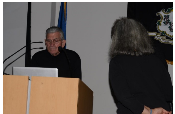
We struggled with some persistent technical difficulties, but everyone hung in their as the schedule was rearranged to lessen the impact