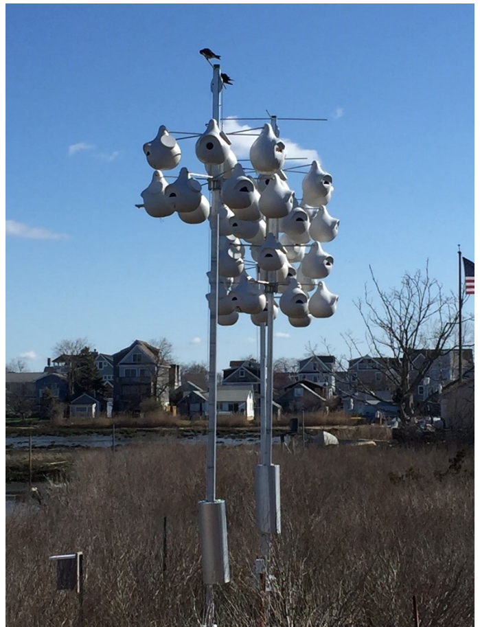
Connecticut Audubon's Coastal Center at Milford Point improved its Purple Martin housing

Farmington Valley Academy Montessori $500.00. The school has incorporated Cornell Lab's Project Feeder Watch into their science curriculum and need materials and binoculars.